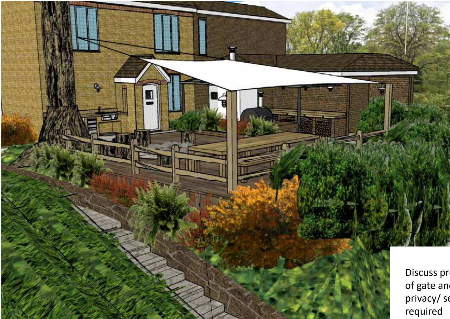
Raised deck with Millboard sides softened by ferns and woodland planting at verges