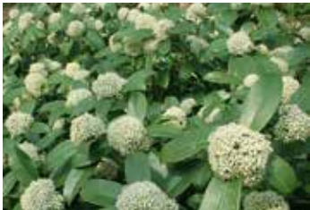
Evergreen Skimmia with glossy leaves, neatly domed habit and early scented flowers