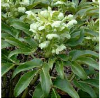
Fiery Berberis with evergreen Hellebore for year round interest