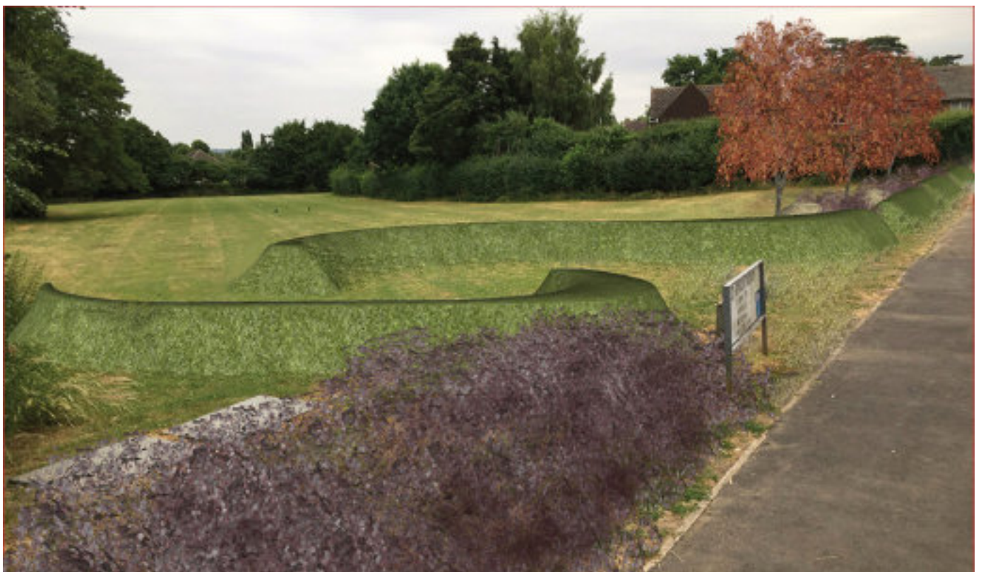
View from West end of field looking East