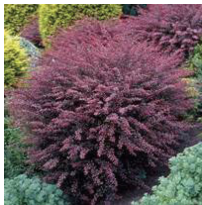
Red Berberis. Hardy, lightly tawned evergreen shrub to underplant Rowan and complement its colour. Can be planted individually or formalised into a hedge or larger scale surface cover for texture and colour.