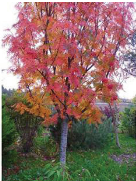
Japanese Rowan tree. Compact with small crown and rich autumn colour

Narrow openings between grass banks provide visual relief, pedestrian access and space for optional decorative planting