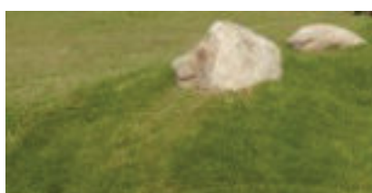
Rocks integrated into new planting