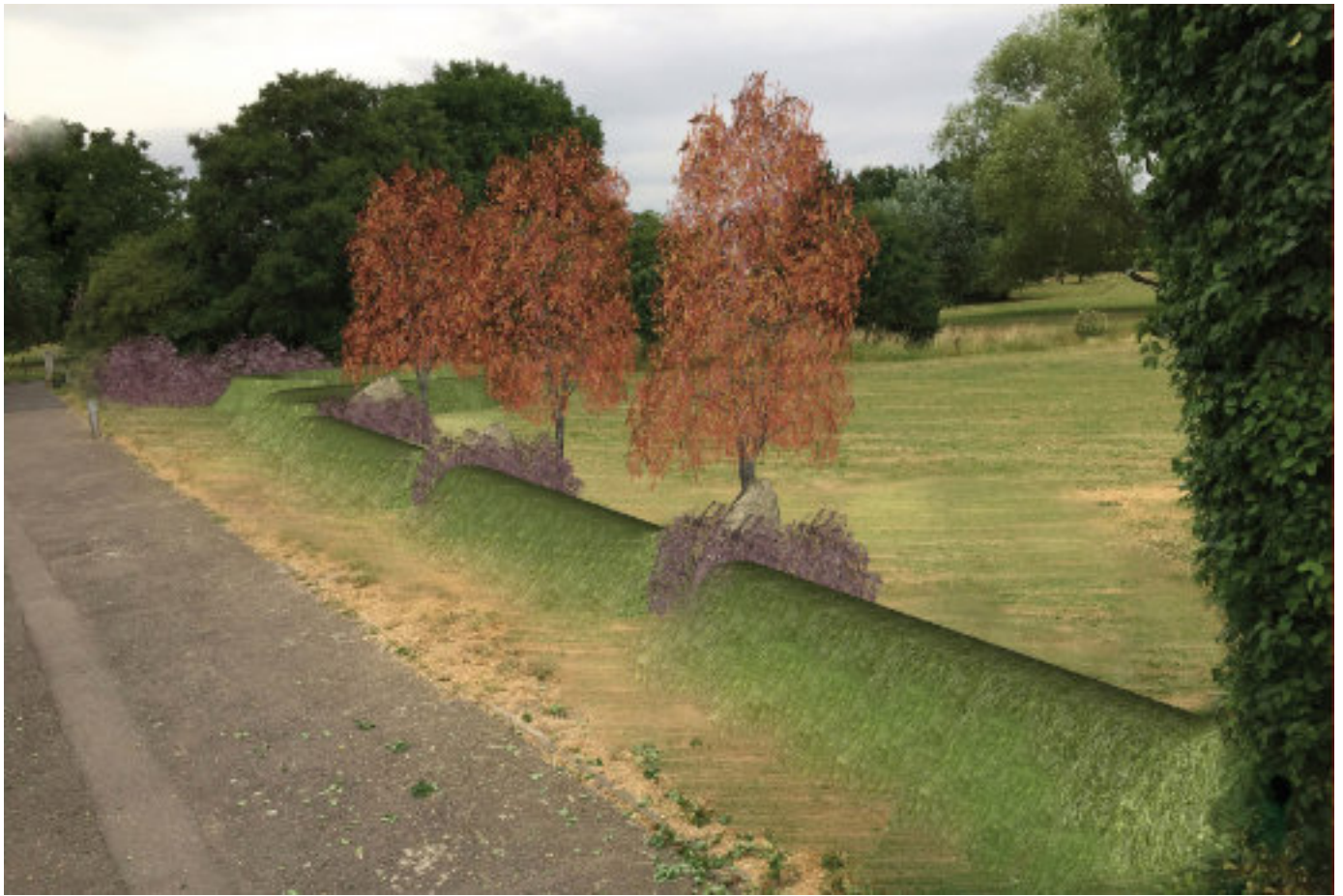
View from East end of field looking West