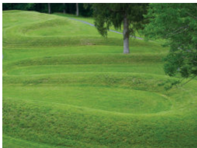
Grass bank, undulating and linear designs